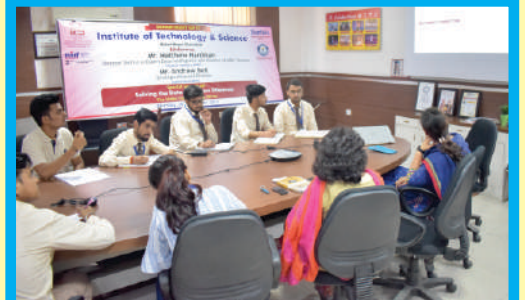
Department of IT organized a Webinar on Solving the Data Protection Dilemma on September 26, 2019