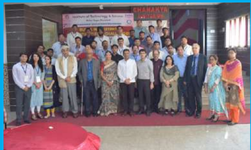
Department of Management organized MDP on "Rural marketing: Opportunities & Challenges" for a total of 40 executives from all over India.