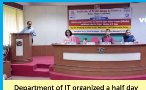
Department of IT organized a half day session on "Effective and Practical Tips on Massive Open Online Courses (MooCs) and Preparation for Higher Studies & IT Jobs " on August 02, 2019