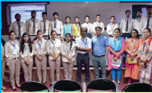
Department of Management organized webinar on "AGNi - Enabling Technology Commercialization" for PGDM (2019 – 21) on August 6, 2019