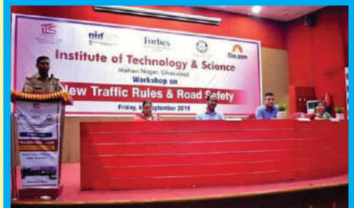
I.T.S UG Campus organized a workshop on "New Traffic Rules and Road Safety" on September 6, 2019.