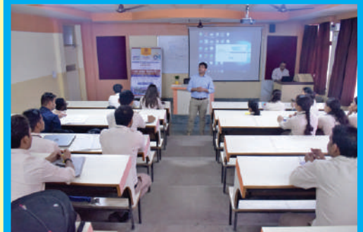
Department of IT organized a one day workshop on "Angular JS" on July 22, 2019