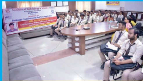
I.T.S UG Campus organized a Video Conferencing session under Alumni Talk Series on "Database Usefulness & Its Real Time Application" for BCA III Year on September 12, 2019