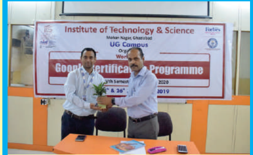
I.T.S UG Campus organized GOOGLE CERTIFICATION WORKSHOP on September 23 - 25, 2019