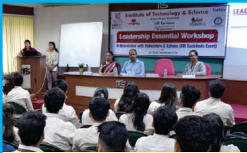
I.T.S UG Campus organised Two Days Workshop on "Leadership Essentials" by MakeIntern (Echoes event of IIM-Kozhikode) on September 23 - 24, 2019