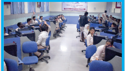
Department of IT organized a one day Workshop on "Product Design & Development" on November 14, 2019.