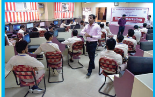
I.T.S UG Campus IT Club organised Two Days Workshop on "Digital Marketing" on October 21& 22, 2019.