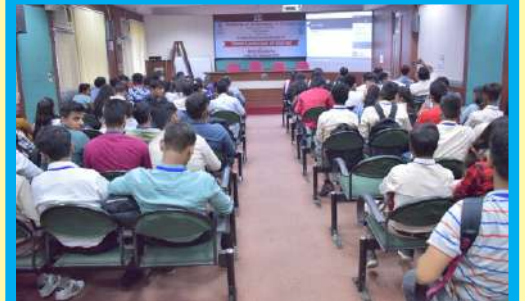
I.T.S UG Campus organized a Webinar on "Threat Landscape of Internet" for BCA students on September 13, 2019