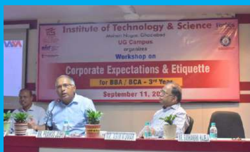
I.T.S UG Campus organized a workshop on "Corporate Expectations & Etiquette" on September 11, 2019.