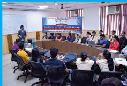
Department of IT organized Session on "Basic Etiquette and Traits to Succeed in Corporate" on July 20, 2019