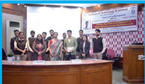
Department of Management organized workshop on "Customer Acquisition and Engagement in Digital Marketing through Gamification and AI"