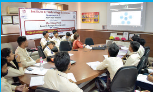
Department of IT organized a video conferencing session on "Data Readiness for AI" on November 4, 2019