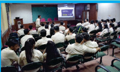
Department of Management organized Webinar on "Emerging Global Trends in Education" for on 5th November 2019 MBA Students