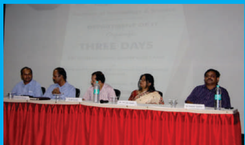
Department of IT organized a 3-day DST Sponsored Entrepreneurship Awareness Camp under DST- NIMAT programme during November 04-06, 2019