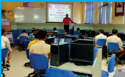
Department of IT organized a one day Workshop Application Development using Python" on October 12, 2019