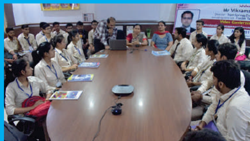
Department of Management organized a video conferencing session on "Understanding Management Thoughts through Mythological Tales" for MBA student on September 25, 2019