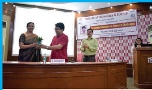
Department of Management organized workshop on "Corporate Governance: Issues & Challenges" on 5th November, 2019.