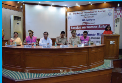
I.T.S UG campus organized a Session on "Women Safety" for Girl Students by Women Cell on October 03, 2019