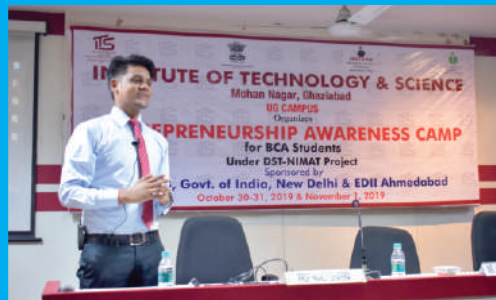
I.T.S UG campus Entrepreneur-Cell organized a 3- Days "Entrepreneurship Awareness Camp (EAC)", sponsored by NSTEDB- DST & EDII Ahmedabad.