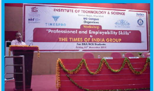
I.T.S UG campus organized a workshop on "Professional and Employability Skills" on November 01, 2019