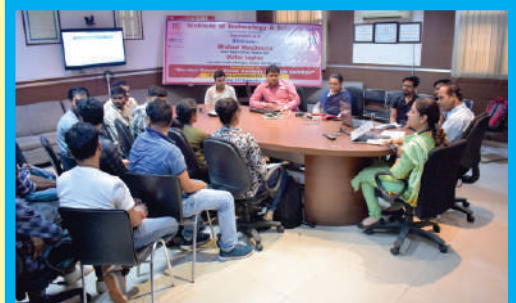
Department of IT organized a special session on "Service Centric Cloud Campus Network Solution" on September 12, 2019.