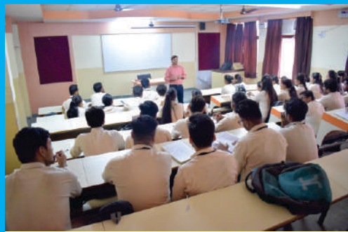
Department of IT organized a 2- day workshop on Java Technology on July, 10 and 11, 2019