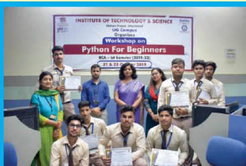
I.T.S UG Campus IT club organised Two Days Workshop on "Python for Beginners" on October 21 & 22, 2019.