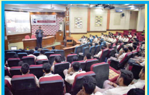
I.T.S UG Campus organized a Workshop on 'SALES KA SUPERSTAR' on October 22, 2019.