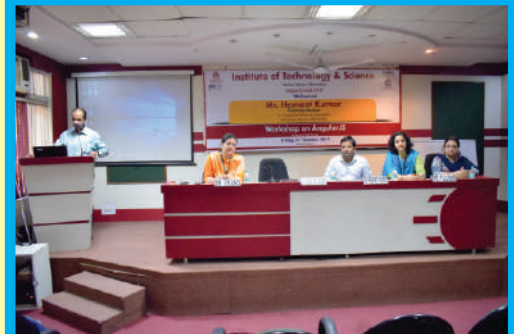
Department of IT organized a one day workshop on "Angular JS" on October 11, 2019