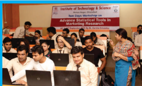
Department of Management organized workshop on "Advance statistical tool in marketing research" on September 19- 20, 2019