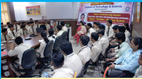
Department of Management organized a video conferencing session on "Future of Data- Data Protection, Data Privacy and Data Localization" for PGDM students on September 25, 2019