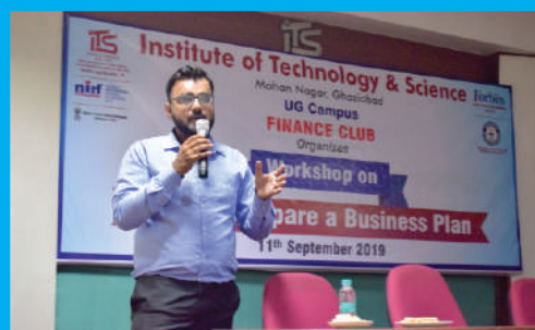
I.T.S UG campus Finance Club organized a Workshop on "How to Prepare a Business Plan" on September 11, 2019.