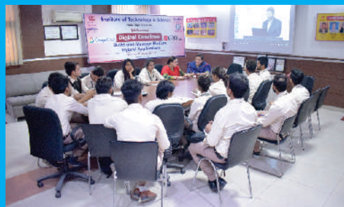
Department of IT organized a webinar on Google Cloud & ETClO.com: Digital Conclave on "Build and Manage Modern Hybrid Applications" on November, 07 2019