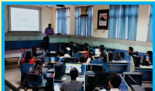
Department of IT organized a one day Workshop on IoT (Internet of Things) during September 19-20, 2019.