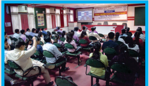
Department of Management organized webinar on "Budget Decoded: Impact of FY20 Union Budget" on 5th July 2019 for PGDM students