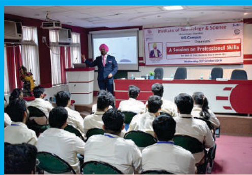
I.T.S UG Campus organized a Session on Profession Skills for BBA 2019-22 on October 23, 2019