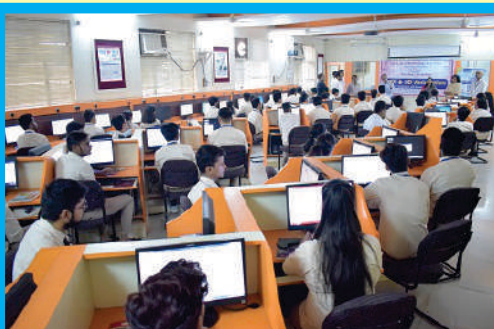
I.T.S UG Campus IT club organised Two Days Workshop on "VFX & 3D Animation" on October 21 & 22, 2019.