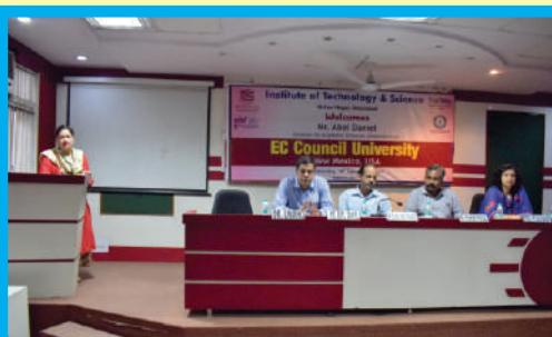
Department of IT organized a session on Cyber Security on September 18, 2019.