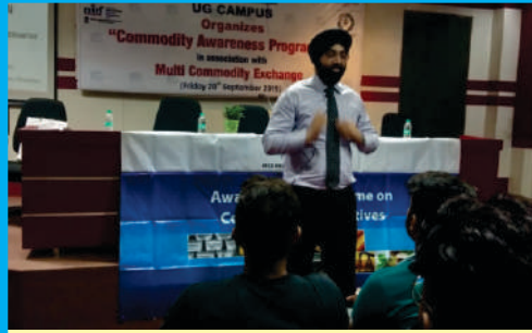
I.T.S UG Campus organized "Commodity Awareness Programme in Association with Multi Commodity Exchange" on September 20, 2019