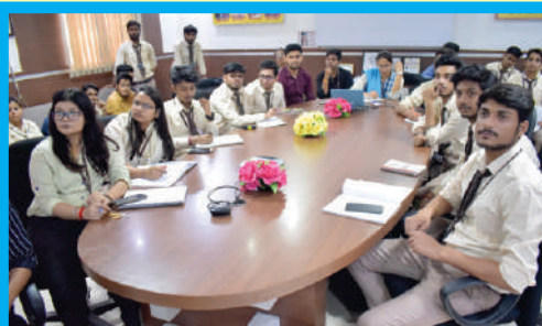
Department of Management organized Webinar on "Intellectual Property Talent Search Examination" by ASSOCHAM on 11th October 2019 for PGDM students