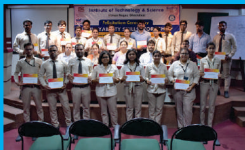
Department of Management organized workshop on "Employability Skills" in collaboration with Rubicon Skill development Pvt. Ltd. on August 02, 2019