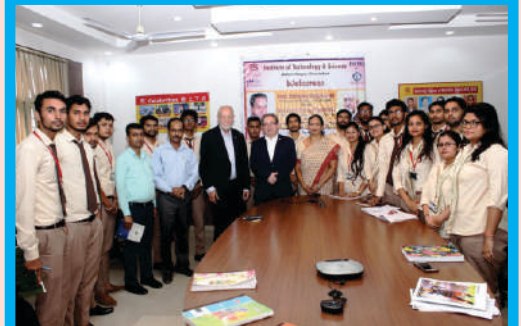
Department of Management organized a session on "Cloud Computing" for MBA (2018 – 20)