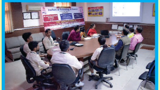
Department of IT organized a webinar on "NASSCOM Software Testing to Digital Quality" on November 14, 2019