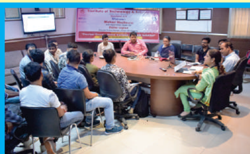
I.T.S UG campus organized a workshop on "Cyber Security- Importance and Career Options" on September 18, 2019.