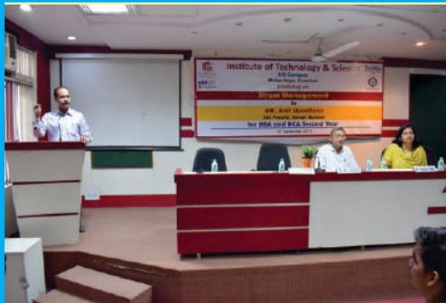
I.T.S UG campus organized a workshop on "Stress Management" on September 19, 2019