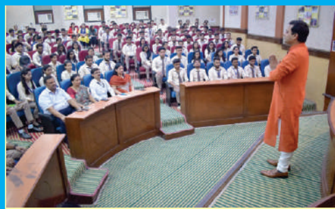
I.T.S - Mohan Nagar organized a workshop on Stress reduction and Wellness for the students of MBA and MCA Program on 14th October 2019.