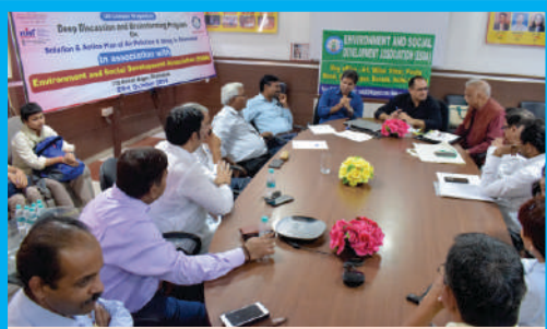
I.T.S UG Campus organized brainstorming program on "Solution & Action Plan of Air Pollution & Smog in Ghaziabad" on October 23, 2019